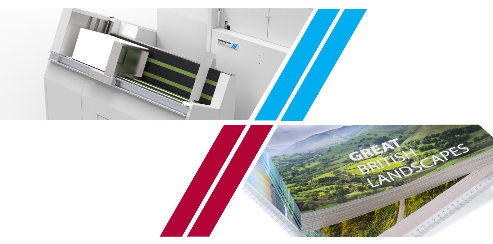
BLM550+ for Canon